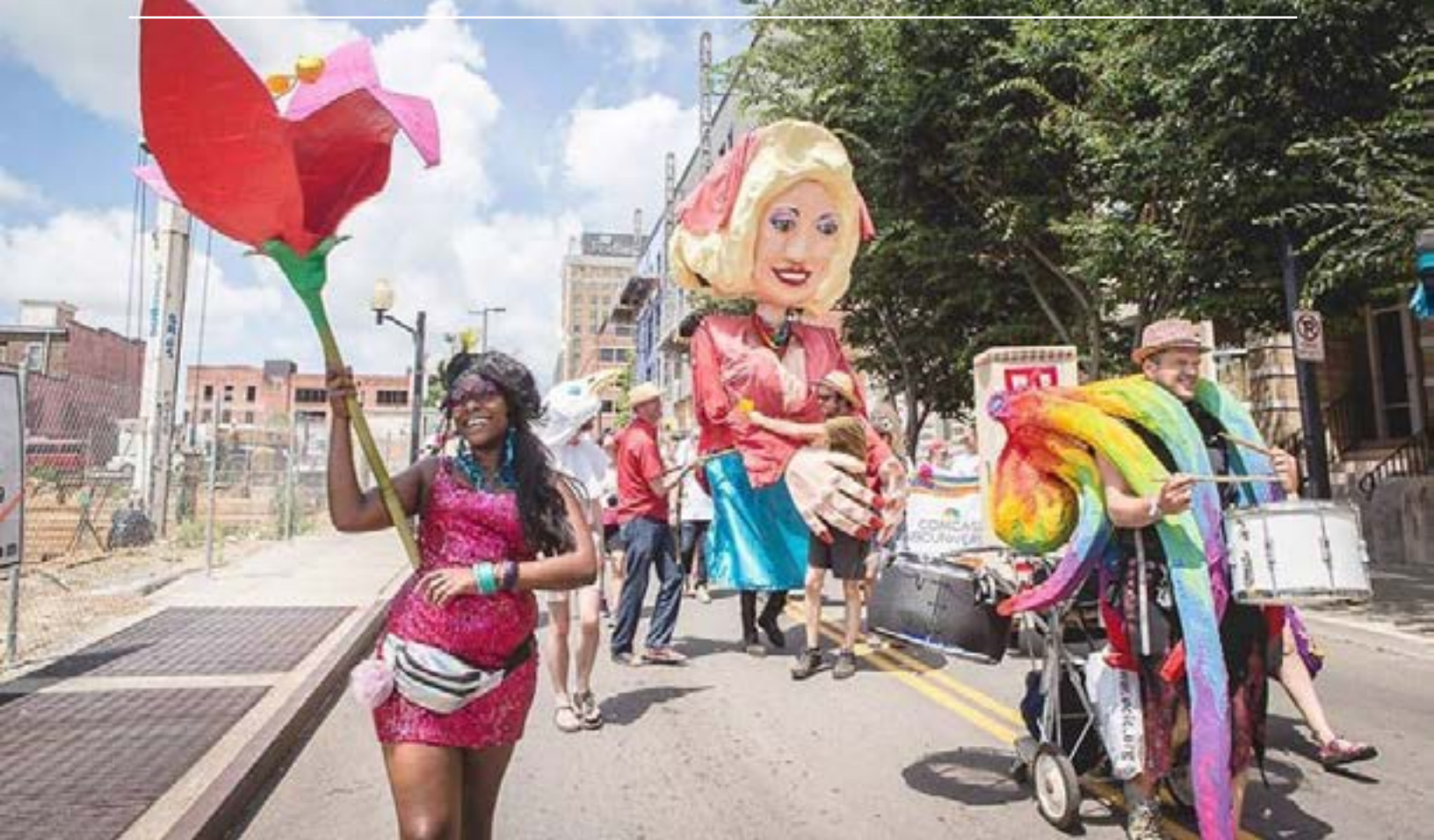
The Appalachian Puppet Pageant makes its way through East Knoxville, with the giant Dolly Parton puppet in tow

of these challenges, they are paying the support forward and leveraging their grant funds to boost resources for their broader communities.