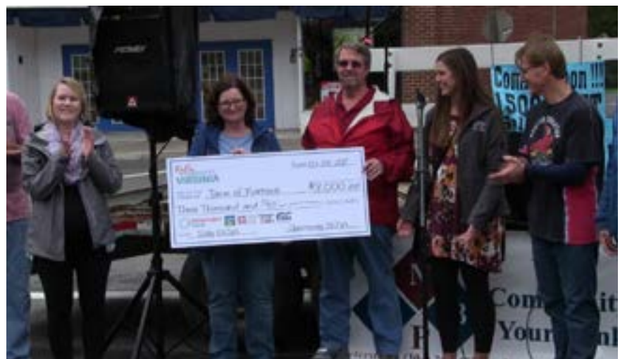
Narrows RALLY project participants highlighting their work at the Narrows Fall Festival

The lessons learned through these collaborative projects launched a unique network of entrepreneurship-support organizations that now provide a model across the state, with partners like the Virginia Tourism Corporation, The Virginia Department of Housing and Community Development, and Friends of Southwest Virginia working together with UVa-Wise to provide leadership and guidance to 33 different supporting organizations across 19 counties.